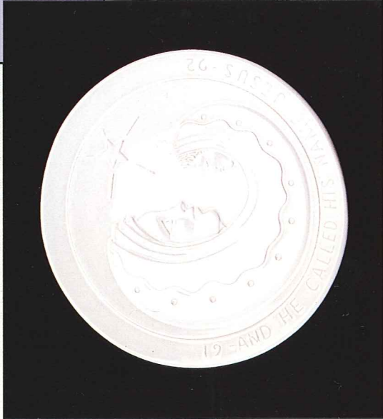
CP92-Christmas Plate "And He Called His Name Jesus"